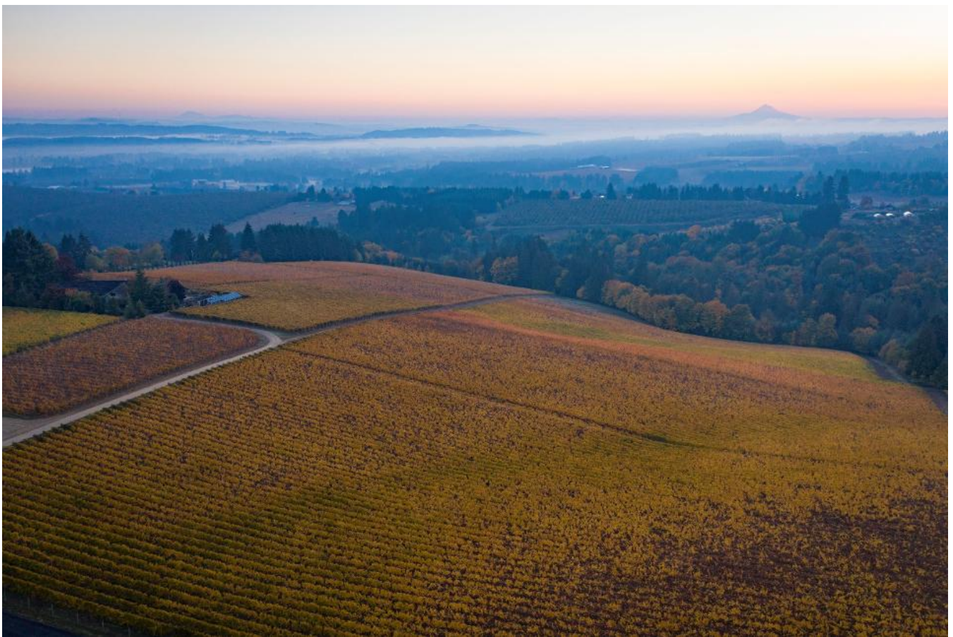
Ponzi Vineyard, View from Aurora Vineyard

I write about wines and spirits and the hidden corners of the world